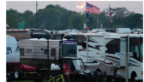
THE CAMP SCHOLLER EXPERIENCE THERE IS A PALPABLE BUZZ...