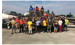
SPECIAL FLIGHT RALLY WITH OUR FRIENDS FROM ENVISION UNLIMITED