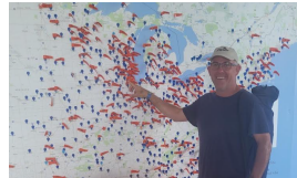
FROM THE LEFT SEAT I HAVE JUST ONE WORD FOR AUGUST: WOW!