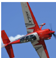
AEROBATICS! AN INVITATION FROM IAC CHAPTER 1