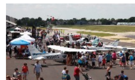
CAVALCADE OF PLANES SATURDAY, JUNE 4TH & SUNDAY, JUNE 5TH