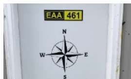
FROM THE LEFT SEAT EAA 461 WILL HOST THE FORD TRIMOTOR JUNE 3 - 5