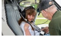
YOUNG EAGLES NOTAM A NOTE FROM EAA HQ ABOUT PROCEDURES