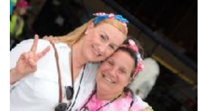
CAVALCADE OF PLANES PHOTOS PERFECT WEATHER AND A HUGE CROWD!