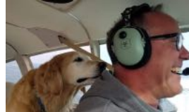
FROM THE LEFT SEAT PLEASE FASTEN YOUR SEATBELTS